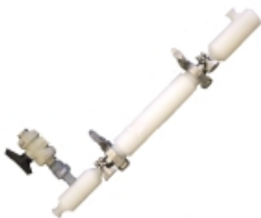
Injection Manifold with In-line Static Mixer