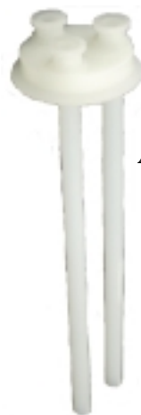
3" Sanitary Cap with Aseptic Sanitary Dip Tubes